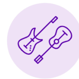
Guitar & bass